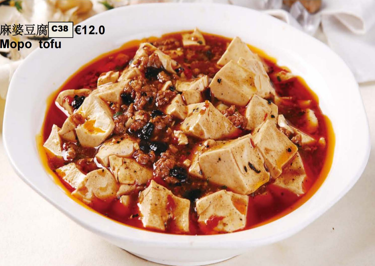
麻婆豆腐 C38 €12.0 Mopo tofu